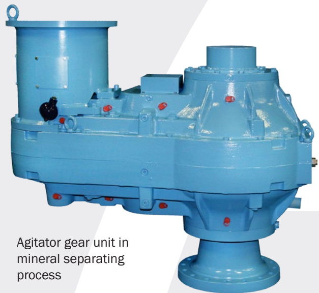
Agitator gear unit in mineral separating process