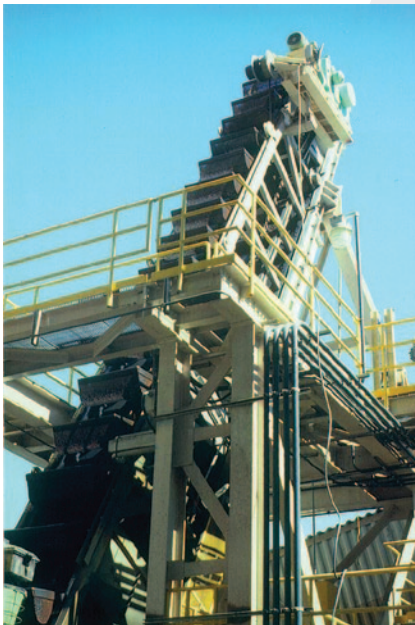
Bucket excavator drives